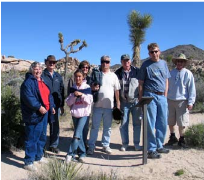
Joshua Tree