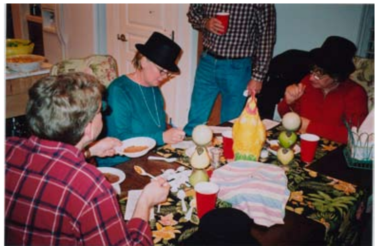
2005 Chili Judges hard at work