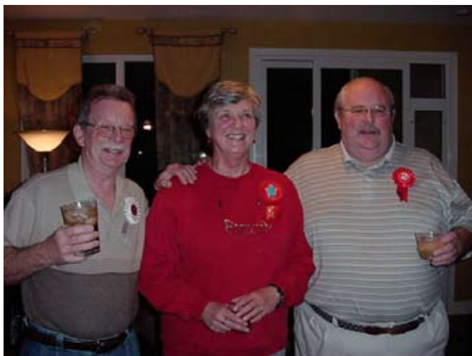
2005 Chili Winners