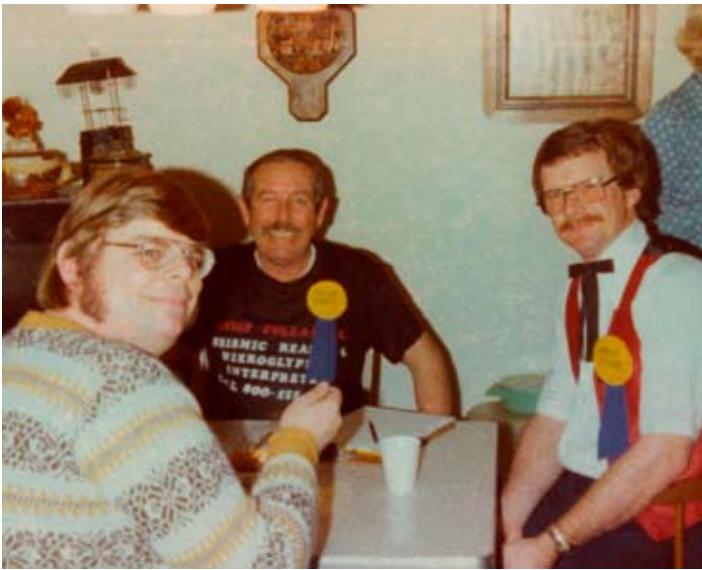
The 1979 Chili Judges