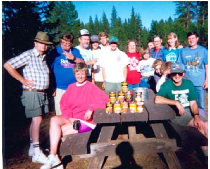
Annual Campout - 1995 (Susanville area)