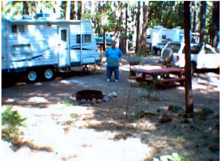
RR Park