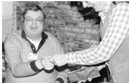
Not all of our Chili contest have been on the up & up.