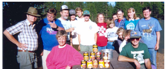
1995 Campout - cans of beans for the evening chili pot.